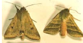
Bollworm (left) and tobacco budworm (right)

Captures of adult tobacco budworm (TBW) and bollworm (BW) in pheromone traps at EREC this season and last season are pictured below. The scales on the 2008 and 2007 charts are the same to illustrate where we are compared with last year. As you can see, we observed tremendous increases in bollworm captures – a little heavier than that observed during late July in 2007. Numbers of TBW were down this past week.